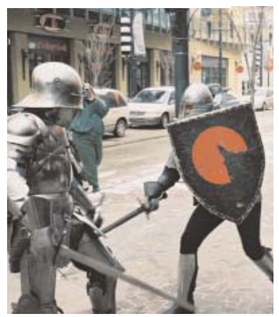
Local 1645 at the Glenbow Museum Launches the Alberta Heritage Campaign, March 4