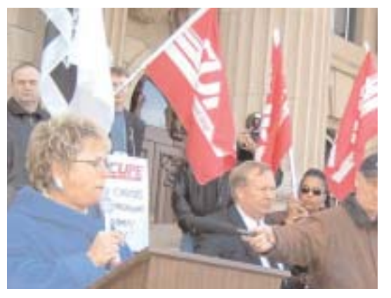
Rally Against Bill 27 March 21