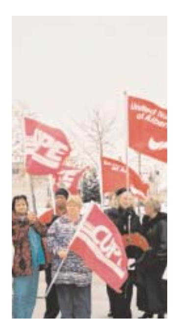
Local 2111 marches on April 1 Foolish Legislation Day