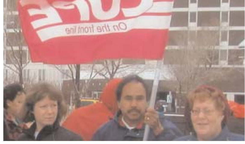
Local 2111 marches on April 1, Foolish Legislation Day