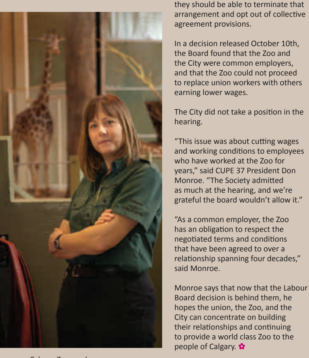
Calgary Zoo employees won an important victory after their employer tried to strip them of their union rights.

CALGARY -- CUPE 37 has won a Labour Relations Board case against the Calgary Zoo Society after successfully arguing that the Society